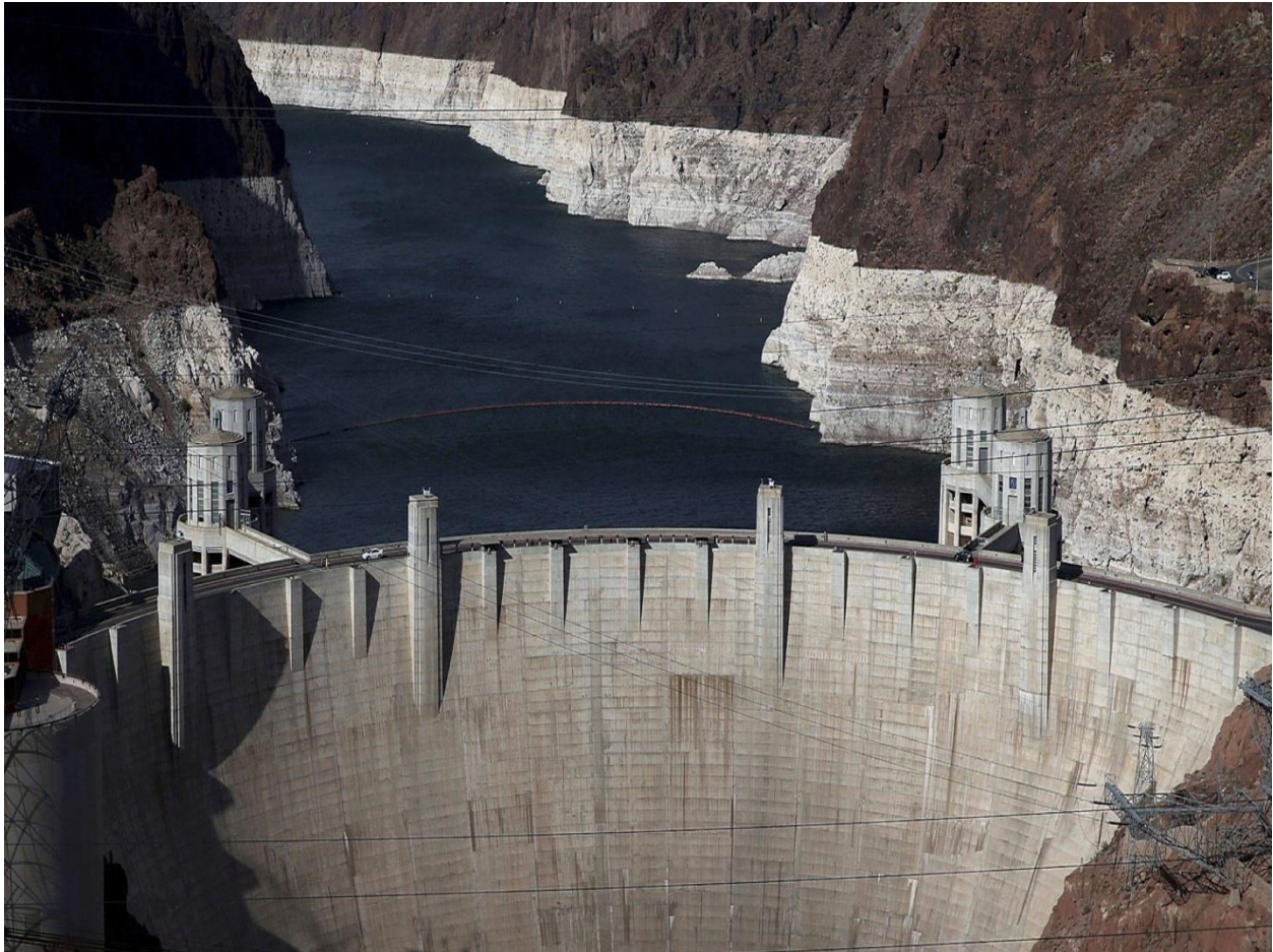
Hoover Dam, Lake Mead

Support provided by the Janet Quinney Lawson Foundation, Bureau of Reclamation, and Denver Water University of Arizona, April 3-4, 2018